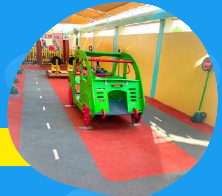
SHADED CYCLE TRACK AREA